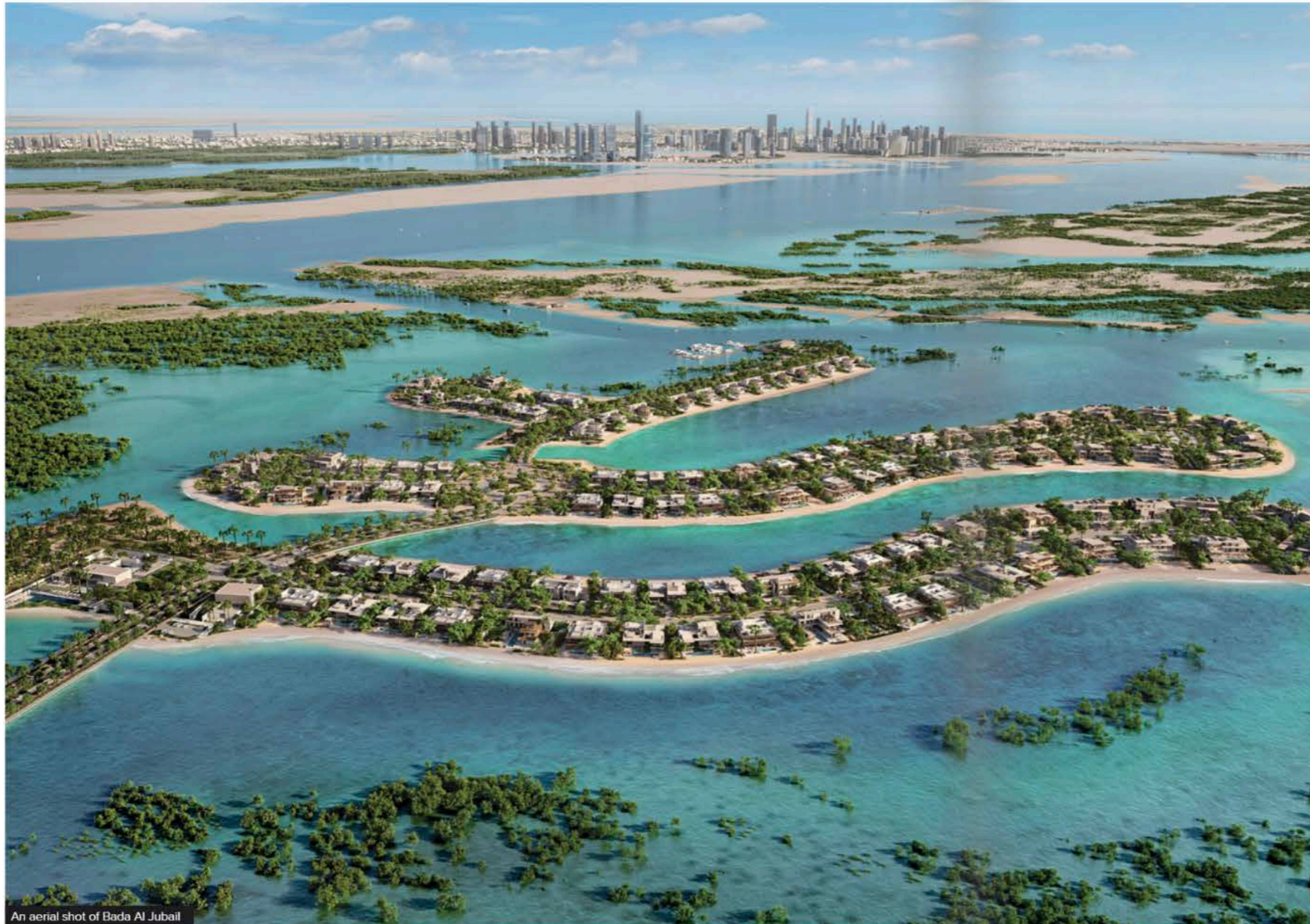
An aerial shot of Bada Al Jubail